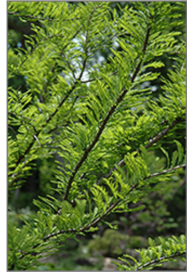
Baldcypress foliage

This tree should only be grown in full sunlight. It is an amazingly adaptable plant, tolerating both dry conditions and even some standing water. It may require supplemental watering during periods of drought or extended heat. It is not particular as to soil type, but has a definite preference for acidic soils, and is subject to chlorosis (yellowing) of the foliage in alkaline soils. It is somewhat tolerant of urban pollution. Consider applying a thick mulch around the root zone in winter to protect it in exposed locations or colder microclimates. This species is native to parts of North America.