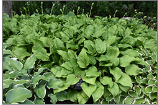
Royal Standard Hosta

Royal Standard Hosta is recommended for the following landscape applications;