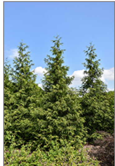
Green Giant Arborvitae