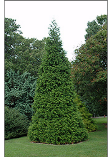
Green Giant Arborvitae