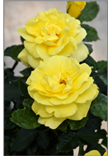
Sunsprite Rose flowers