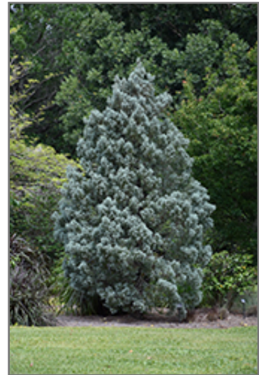
Blue Ice Smooth Arizona Cypress