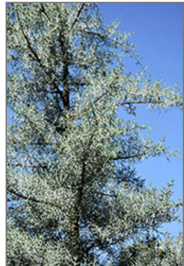
Blue Ice Smooth Arizona Cypress foliage