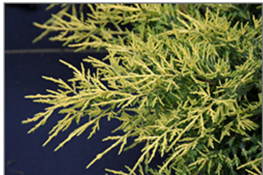
Saybrook Gold Juniper foliage