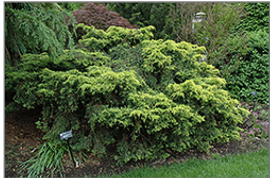
Saybrook Gold Juniper