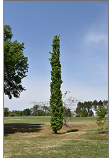
Slender Silhouette Sweet Gum