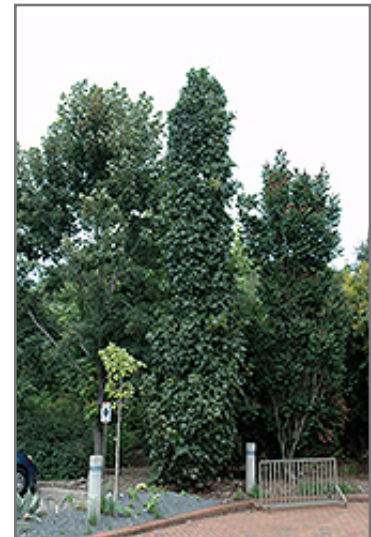
Slender Silhouette Sweet Gum