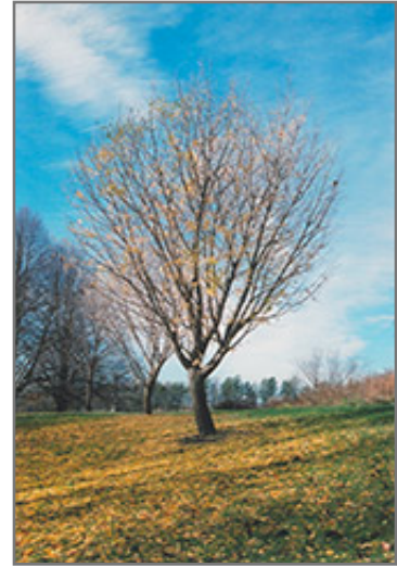
Autumn Gold Ginkgo in fall

This tree should only be grown in full sunlight. It is very adaptable to both dry and moist locations, and should do just fine under average home landscape conditions. It may require supplemental watering during periods of drought or extended heat. It is not particular as to soil type or pH, and is able to handle environmental salt. It is highly tolerant of urban pollution and will even thrive in inner city environments. Consider applying a thick mulch around the root zone in winter to protect it in exposed locations or colder microclimates. This is a selected variety of a species not originally from North America.