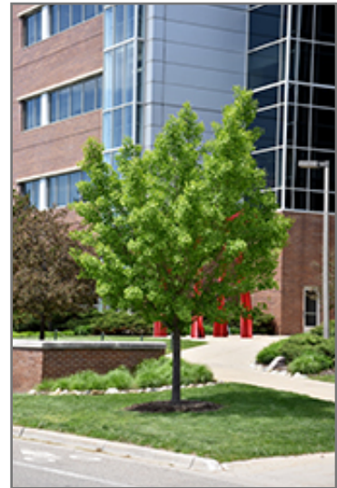
Autumn Gold Ginkgo