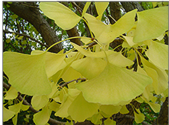
Autumn Gold Ginkgo foliage