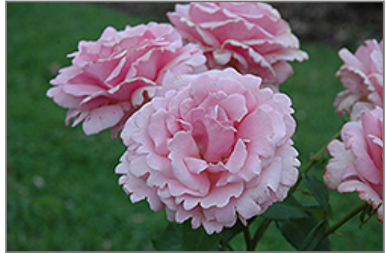
Memorial Day Rose flowers