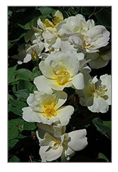
Sunny Knock Out Rose flowers

Thousand Oaks Location 2585 Thousand Oaks San Antonio, TX 78232 (210) 494-6131