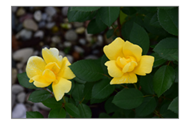
Sunny Knock Out Rose flowers