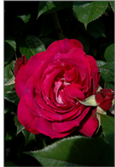
Wild Blue Yonder Rose flowers

Wild Blue Yonder Rose is recommended for the following landscape applications;