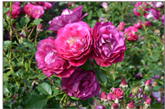
Wild Blue Yonder Rose flowers