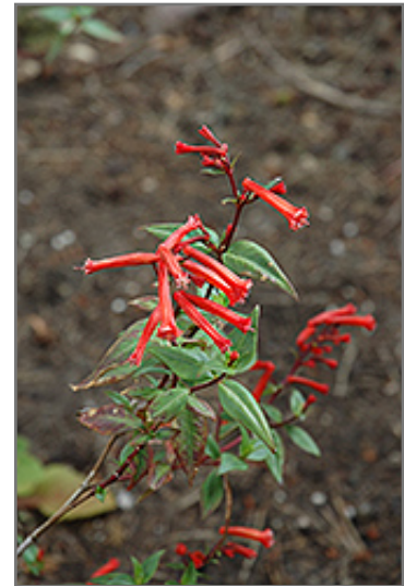
Cigar Flower flowers

Cigar Flower will grow to be about 16 inches tall at maturity, with a spread of 18 inches. It tends to fill out right to the ground and therefore doesn't necessarily require facer plants in front. It grows at a medium rate, and under ideal conditions can be expected to live for approximately 10 years.