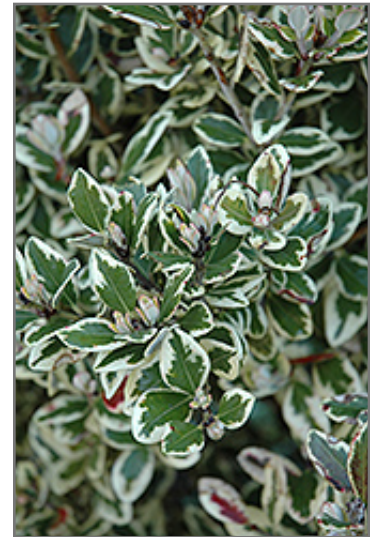
Variegated New Zealand Christmas Bush foliage

Variegated New Zealand Christmas Bush will grow to be about 6 feet tall at maturity, with a spread of 6 feet. It tends to fill out right to the ground and therefore doesn't necessarily require facer plants in front, and is suitable for planting under power lines. It grows at a medium rate, and under ideal conditions can be expected to live for approximately 10 years.