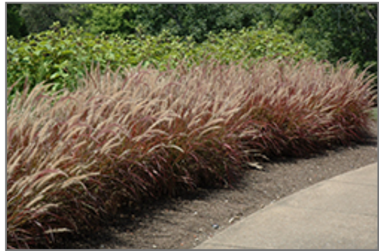
Purple Fountain Grass in bloom

Purple Fountain Grass will grow to be about 4 feet tall at maturity, with a spread of 3 feet. It grows at a medium rate, and under ideal conditions can be expected to live for approximately 10 years. As an herbaceous perennial, this plant will usually die back to the crown each winter, and will regrow from the base each spring. Be careful not to disturb the crown in late winter when it may not be readily seen!