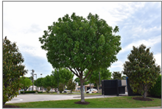
Chinese Pistache