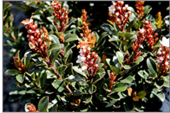
Dwarf Yeddo Hawthorn flowers

This shrub does best in full sun to partial shade. It prefers to grow in average to moist conditions, and shouldn't be allowed to dry out. It may require supplemental watering during periods of drought or extended heat. It is not particular as to soil type or pH. It is somewhat tolerant of urban pollution. This is a selected variety of a species not originally from North America.