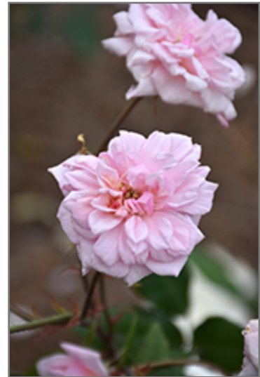
Cecile Brunner Rose flowers