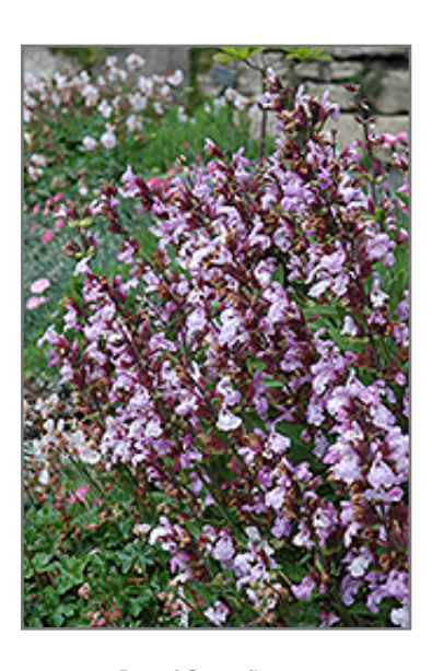
Dwarf Sage flowers

Aside from its primary use as an edible, Dwarf Sage is sutiable for the following landscape applications;