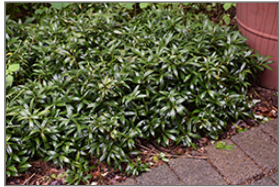
Himalayan Sweet Box

Himalayan Sweet Box is recommended for the following landscape applications;