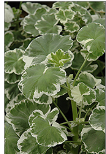
Wilhelm Langguth Geranium foliage

Wilhelm Langguth Geranium's attractive tomentose round palmate leaves remain green in color with distinctive white edges throughout the year on a plant with an upright spreading habit of growth. It features bold balls of lightly-scented red flowers at the ends of the stems from late spring to early fall. The flowers are excellent for cutting.