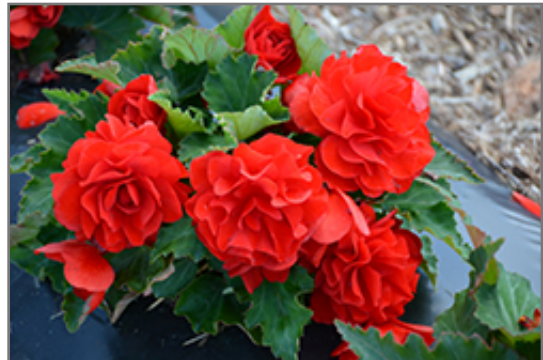
Nonstop Red Begonia in bloom

Nonstop Red Begonia is recommended for the following landscape applications;