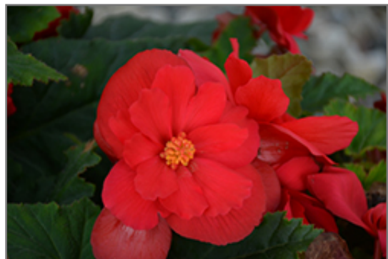
Nonstop Red Begonia flowers