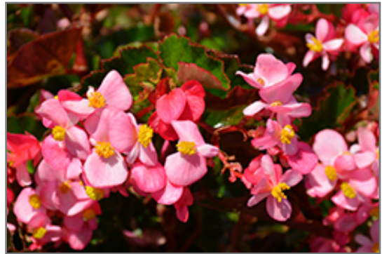
BabyWing Pink Begonia flowers

This is a high maintenance plant that will require regular care and upkeep, and usually looks its best without pruning, although it will tolerate pruning. Deer don't particularly care for this plant and will usually leave it alone in favor of tastier treats. Gardeners should be aware of the following characteristic(s) that may warrant special consideration;