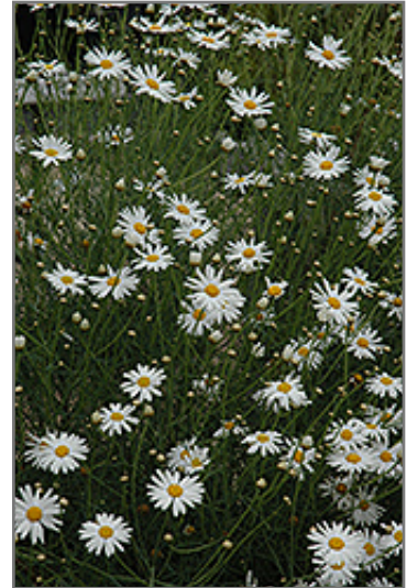
Marguerite Daisy in bloom