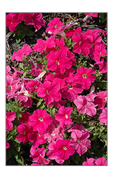
Pretty Grand Deep Pink Petunia flowers

Pretty Grand Deep Pink Petunia will grow to be about 8 inches tall at maturity, with a spread of 12 inches. When grown in masses or used as a bedding plant, individual plants should be spaced approximately 10 inches apart. Its foliage tends to remain low and dense right to the ground. This fast-growing annual will normally live for one full growing season, needing replacement the following year.