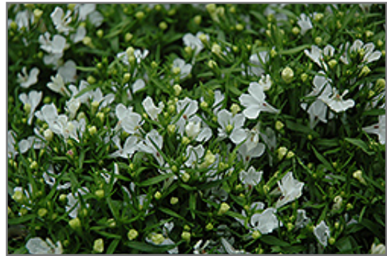
Riviera White Lobelia flowers

Riviera White Lobelia features dainty white flowers at the ends of the stems from mid spring to mid fall. Its tiny narrow leaves remain green in color throughout the season.