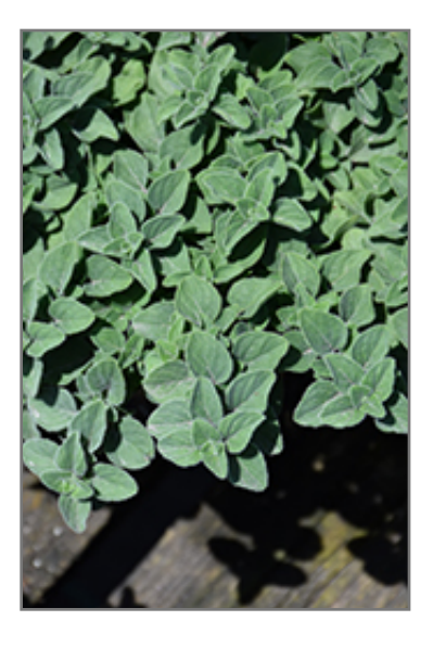
Hot And Spicy Oregano foliage

Aside from its primary use as an edible, Hot And Spicy Oregano is sutiable for the following landscape applications;