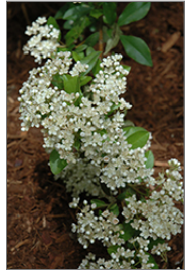
Gnome Firethorn flowers