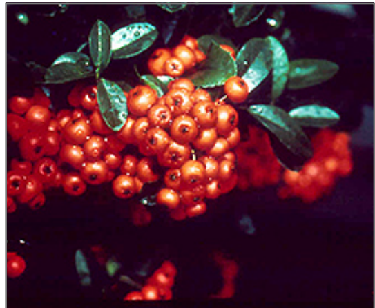
Gnome Firethorn fruit