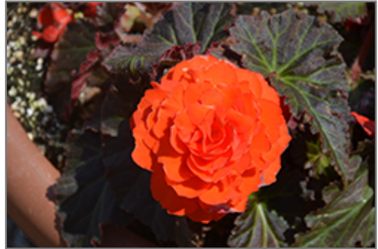
Nonstop Mocca Deep Orange Begonia flowers

Nonstop Mocca Deep Orange Begonia is recommended for the following landscape applications;