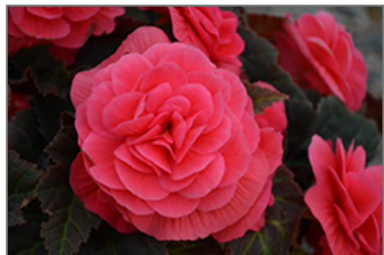
Nonstop Mocca Pink Shades Begonia flowers