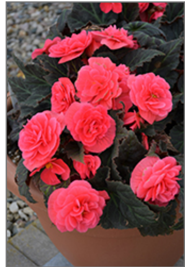
Nonstop Mocca Pink Shades Begonia in bloom