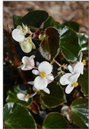
BabyWing White Bronze Leaf Begonia flowers