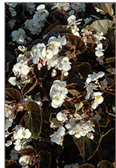
BabyWing White Bronze Leaf Begonia flowers