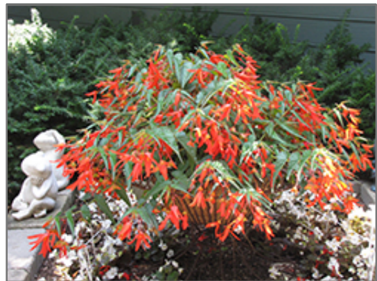
Santa Cruz Sunset Begonia