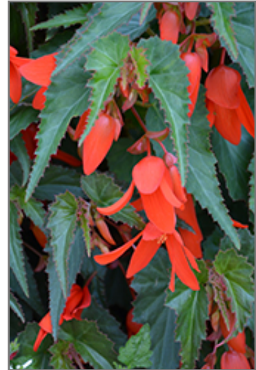
Santa Cruz Sunset Begonia flowers