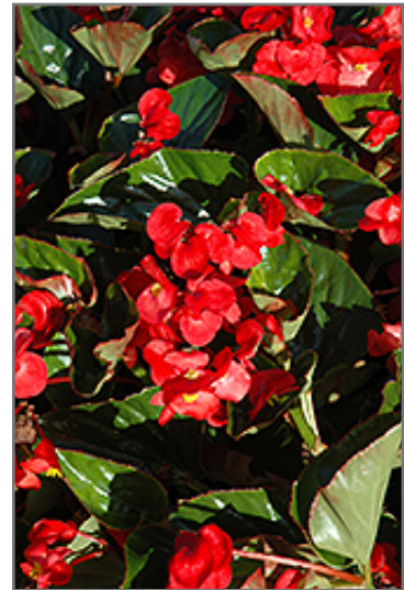
Whopper Red Green Leaf Begonia flowers