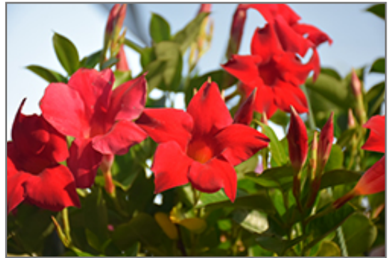
Sun Parasol Crimson Mandevilla flowers

This plant is native to the tropics and prefers growing in moist environments with evenly warm conditions all year round. In our climate, it is usually grown as an outdoor annual in the garden or in a container. If you want it to survive the winter, it can be brought in to the house and provided with special care, and then returned to the garden the following season. In its preferred tropical habitat, as a shrub it can grow to be around 10 feet tall at maturity, with a spread of 24 inches. However, when grown as an annual or when overwintered indoors, it can be expected to perform quite differently, and its exact height and spread will depend on many factors; you may wish to consult with our experts as to how it might perform in your specific application and growing conditions.