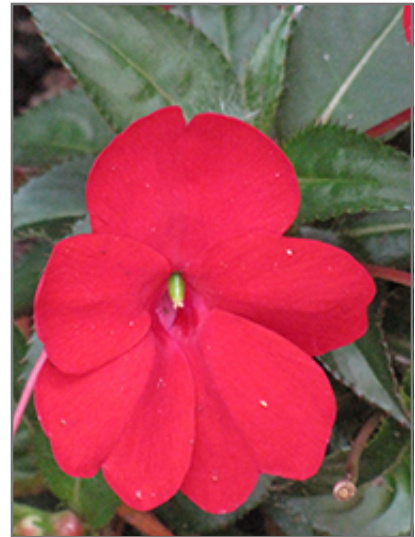
SunPatiens Compact Red New Guinea Impatiens flowers

This plant will require occasional maintenance and upkeep, and should not require much pruning, except when necessary, such as to remove dieback. It is a good choice for attracting bees and butterflies to your yard. It has no significant negative characteristics.