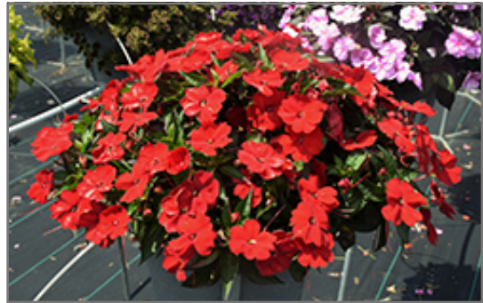
SunPatiens Compact Red New Guinea Impatiens in bloom

SunPatiens Compact Red New Guinea Impatiens will grow to be about 24 inches tall at maturity, with a spread of 24 inches. When grown in masses or used as a bedding plant, individual plants should be spaced approximately 20 inches apart. Its foliage tends to remain dense right to the ground, not requiring facer plants in front. This fast-growing annual will normally live for one full growing season, needing replacement the following year.