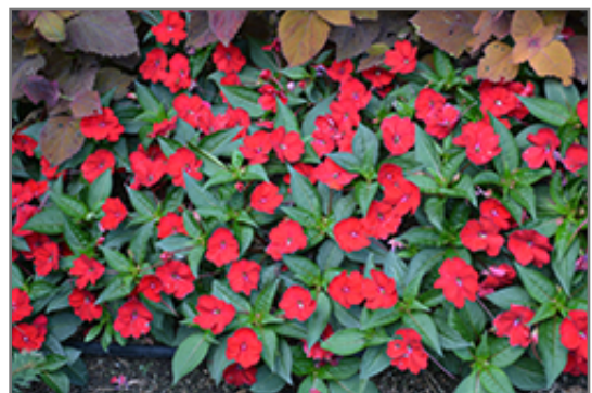
SunPatiens Compact Red New Guinea Impatiens in bloom