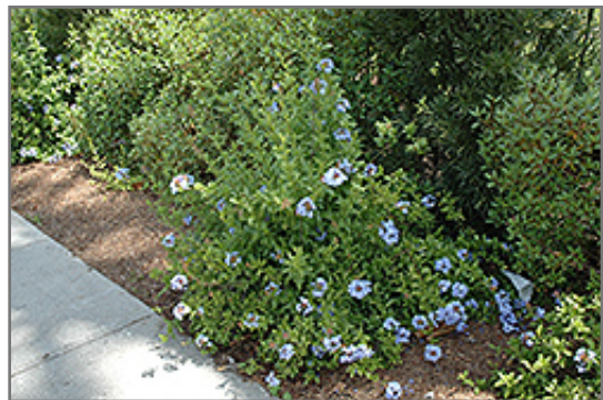
Cape Plumbago in bloom