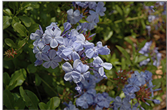
Cape Plumbago flowers

Cape Plumbago is recommended for the following landscape applications;