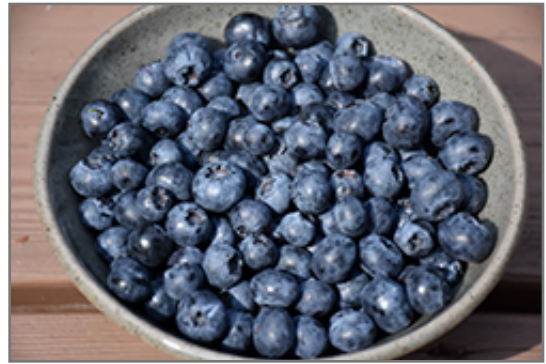
Tifblue Rabbiteye Blueberry fruit

Tifblue Rabbiteye Blueberry features dainty clusters of white bell-shaped flowers with shell pink overtones hanging below the branches in early spring. It has bluish-green deciduous foliage. The glossy oval leaves turn an outstanding red in the fall. It features an abundance of magnificent blue berries from late spring to early summer.