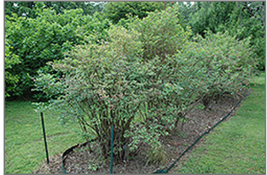
Tifblue Rabbiteye Blueberry

This shrub is typically grown in a designated area of the yard because of its mature size and spread. It does best in full sun to partial shade. It does best in average to evenly moist conditions, but will not tolerate standing water. It may require supplemental watering during periods of drought or extended heat. It is very fussy about its soil conditions and must have sandy, acidic soils to ensure success, and is subject to chlorosis (yellowing) of the foliage in alkaline soils. It is quite intolerant of urban pollution, therefore inner city or urban streetside plantings are best avoided, and will benefit from being planted in a relatively sheltered location. Consider applying a thick mulch around the root zone in winter to protect it in exposed locations or colder microclimates. This is a selection of a native North American species.