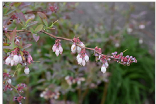
Tifblue Rabbiteye Blueberry flowers