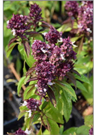
Siam Queen Basil flowers

Siam Queen Basil will grow to be about 16 inches tall at maturity, with a spread of 12 inches. When grown in masses or used as a bedding plant, individual plants should be spaced approximately 10 inches apart. This fast-growing annual will normally live for one full growing season, needing replacement the following year.