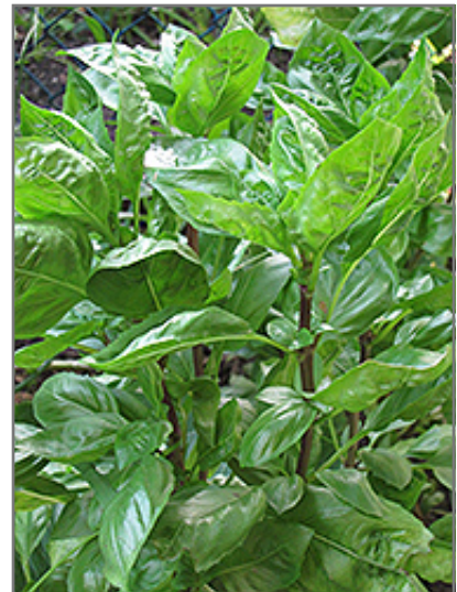
Siam Queen Basil foliage