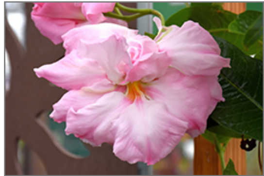
Tango Twirl Mandevilla flowers

This tropical plant does best in full sun to partial shade. It requires an evenly moist well-drained soil for optimal growth. It may require supplemental watering during periods of drought or extended heat. It is not particular as to soil type or pH. It is highly tolerant of urban pollution and will even thrive in inner city environments. This particular variety is an interspecific hybrid, and parts of it are known to be toxic to humans and animals, so care should be exercised in planting it around children and pets. It can be propagated by cuttings; however, as a cultivated variety, be aware that it may be subject to certain restrictions or prohibitions on propagation.