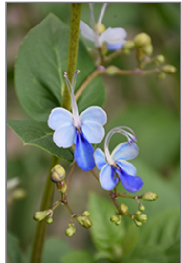
Blue Butterfly Plant flowers