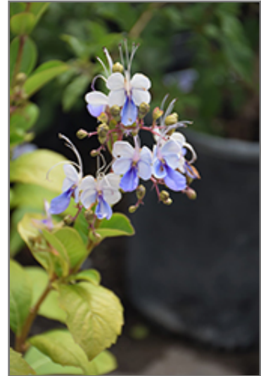
Blue Butterfly Plant flowers

Blue Butterfly Plant makes a fine choice for the outdoor landscape, but it is also well-suited for use in outdoor pots and containers. With its upright habit of growth, it is best suited for use as a 'thriller' in the 'spiller-thriller-filler' container combination; plant it near the center of the pot, surrounded by smaller plants and those that spill over the edges. It is even sizeable enough that it can be grown alone in a suitable container. Note that when grown in a container, it may not perform exactly as indicated on the tag - this is to be expected. Also note that when growing plants in outdoor containers and baskets, they may require more frequent waterings than they would in the yard or garden.