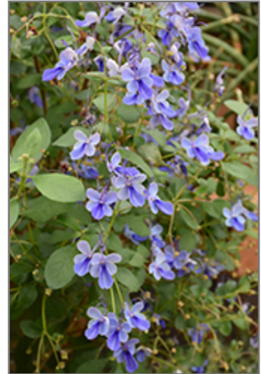
Blue Butterfly Plant flowers