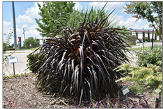
Princess Caroline Fountain Grass

Princess Caroline Fountain Grass is recommended for the following landscape applications;