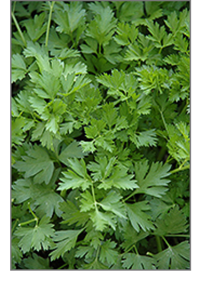
Italian Parsley foliage