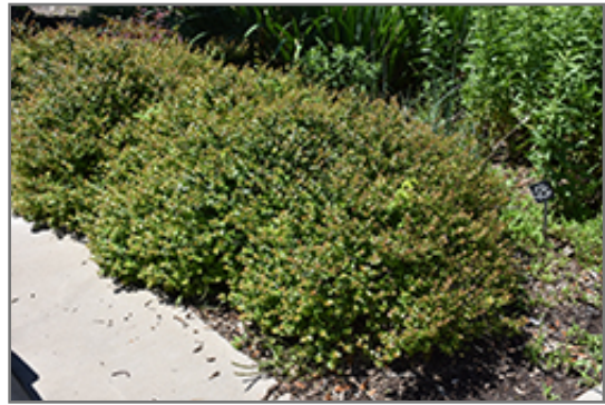
Rose Creek Abelia

Rose Creek Abelia makes a fine choice for the outdoor landscape, but it is also well-suited for use in outdoor pots and containers. Because of its height, it is often used as a 'thriller' in the 'spiller-thriller-filler' container combination; plant it near the center of the pot, surrounded by smaller plants and those that spill over the edges. It is even sizeable enough that it can be grown alone in a suitable container. Note that when grown in a container, it may not perform exactly as indicated on the tag - this is to be expected. Also note that when growing plants in outdoor containers and baskets, they may require more frequent waterings than they would in the yard or garden.