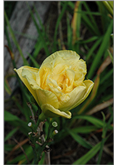
Yellow Submarine Daylily flowers

Yellow Submarine Daylily will grow to be about 20 inches tall at maturity, with a spread of 20 inches. When grown in masses or used as a bedding plant, individual plants should be spaced approximately 16 inches apart. It grows at a medium rate, and under ideal conditions can be expected to live for approximately 7 years. As an herbaceous perennial, this plant will usually die back to the crown each winter, and will regrow from the base each spring. Be careful not to disturb the crown in late winter when it may not be readily seen!