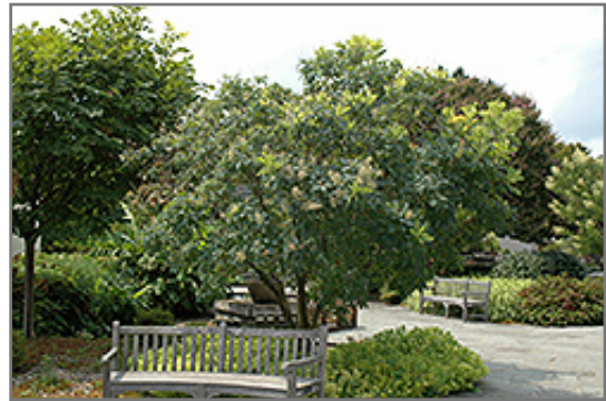
American Smoketree in bloom

American Smoketree is recommended for the following landscape applications;