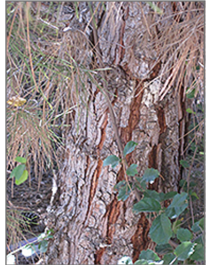
Eldarica Pine bark