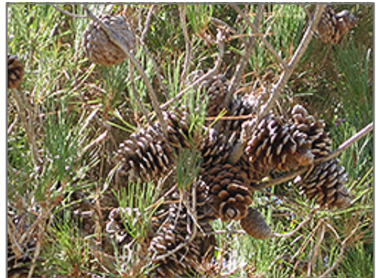
Eldarica Pine fruit