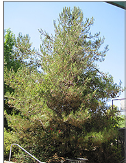
Eldarica Pine

This tree should only be grown in full sunlight. It prefers dry to average moisture levels with very well-drained soil, and will often die in standing water. It is considered to be drought-tolerant, and thus makes an ideal choice for xeriscaping or the moisture-conserving landscape. It is not particular as to soil type or pH, and is able to handle environmental salt. It is highly tolerant of urban pollution and will even thrive in inner city environments. This species is not originally from North America.