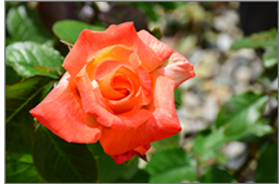
Octoberfest Rose flowers

Octoberfest Rose is recommended for the following landscape applications;