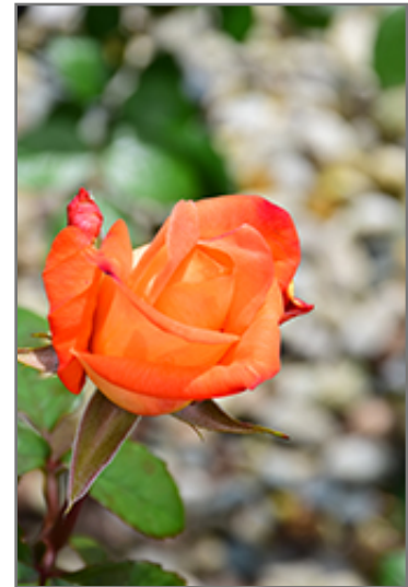
Octoberfest Rose flower buds