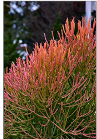
Sticks On Fire Red Pencil Tree foliage

Sticks On Fire Red Pencil Tree is recommended for the following landscape applications;