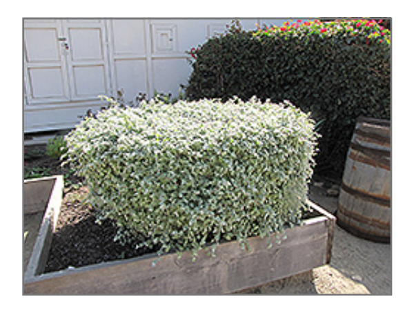
Licorice Plant

Licorice Plant is recommended for the following landscape applications;