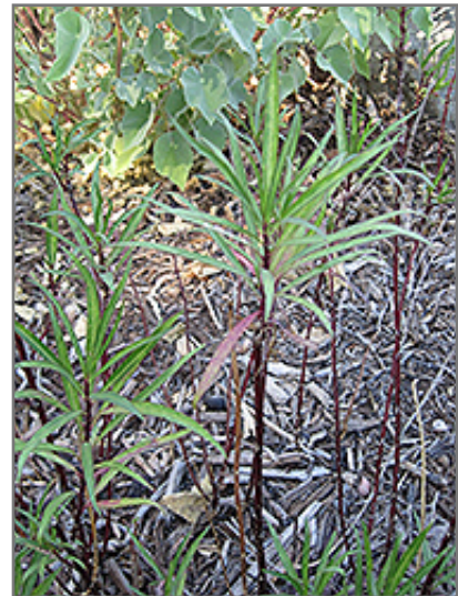
Mexican Cardinal Flower foliage