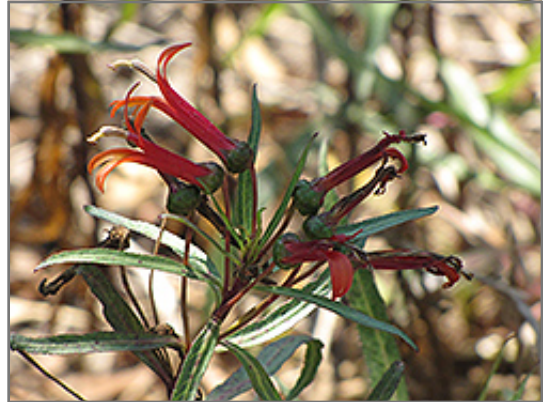
Mexican Cardinal Flower flowers