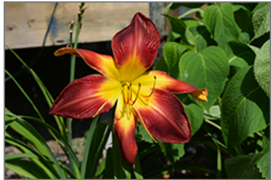
Rainbow Rhythm Ruby Spider Daylily flowers